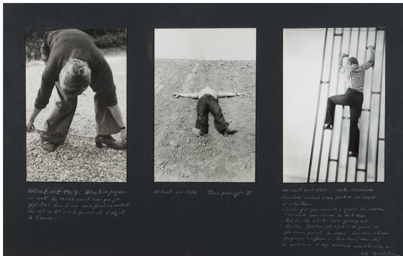
Gina PANE (1939-1990), Extracts, 1969-1971 Three silver print photos on cardboard and on dark wood pannel Estimate: €1,500 - 2,000

PUBLIC AUCTION - DROUOT - SALEROOMS 10 AND 16 Thursday 18 and Friday 19 October - 2pm