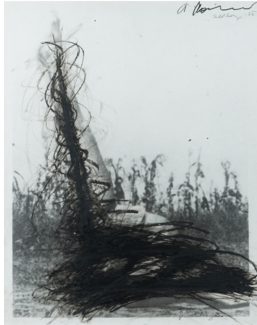
Arnul RAINER (b. in 1929), Feldkerze , 1974 Pencil on a photograph Estimate: €2,500 - 3,000