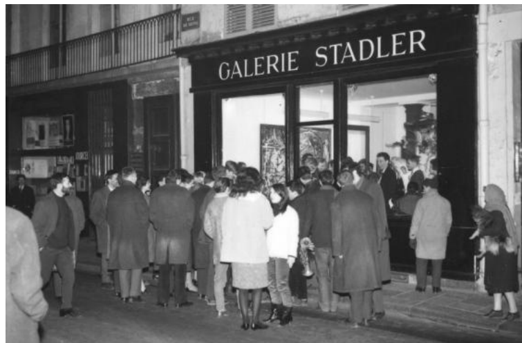
The Stadler gallery in 1962

Tapiès, Appel, Saura, Pane, Luthi, Rainer, Falkenstein, Bluhm, Budd, Shiraga, Imai... The most celebrated artists of the second half of the 20 th century in Europe, United States and Japan will be featured in this important auction.