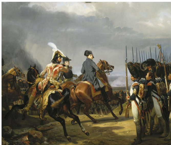
Horace Vernet, La Bataille d'Iéna, 4 octobre 1806

Later, Marochetti built a statue of General Bertrand for the city of Chateauroux.