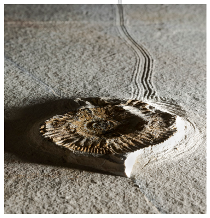
Subplanites rueppellianus Solnhofen limestone Upper Jurassic Tithonian (152-145 mya) Estimate: €40,000 - 45,000