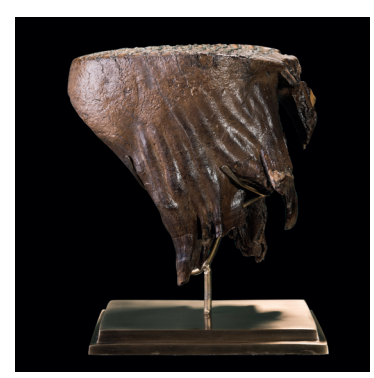
Molar of woolly mammoth - Mammuthus primigenius h. 22,8 cm - I. 20,3 cm Estimate: €800 - 1,000