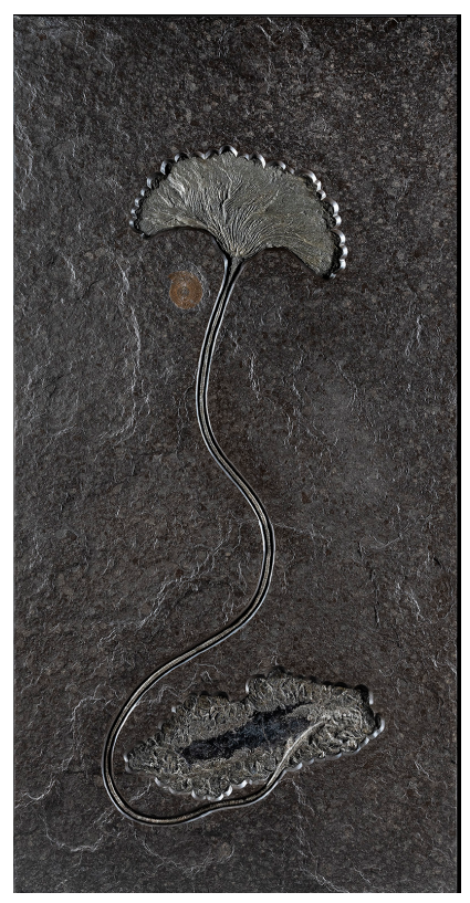
Crinoid, Seirocrinus subangularis Posidonia Shale Formation Lower Jurassic, Pliensbachian – Toarcian (190–175 mya) h. 1.90 m - l. 95 cm Estimate: €20,000 - 25,000