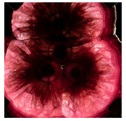
Rhodochrosite polished section Argentine Weight: 145 g h. 43 cm − l. 25 cm − d. 13 cm Estimate: €800 - 1,000