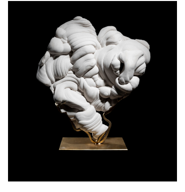
Gogotte Fontainebleau, France h. 79 cm - I. 70 cm - d. 26 cm Estimate: €6,000 - 8,000

A slice of the famous meteorite of Cap York will be also offered. Its huge size - w. 10kg; h. 80cm; l. 45cm - easily makes us imagine how tall was the original meteorite. (Estimate: €4,000-50,000) Cap York meteorite cross section, Agpalilik Weight: 10 kg h. 80 cm – l. 45 cm Estimate: €45,000 - 50,000 Lunar meteorite NWA 11472 Martian meteorite cross section Weight: 371 g h. 15,5 cm – I. 3.8 cm – d. 7 cm NWA 7533, Black Beauty Weight: 2,96 g h. 40 mm – I. 35 mm – d. 1,5 mm Estimate: €18,000 - 20,000 Estimate: €50,000 - 60,000 Skull, mammoth's bones and tooth, bison's horn and skull, ammonite, BACK TO malachite, coral, crinoid, agate, jasper... Minerals or fossilised organic EARTH elements will take a large part of the sale. No one will miss the 13 meters long fossil that shows how an ammonite travelled 150 million years ago. It is the most important fossilised mark of an organic Life remaining in private hands. (Estimate: €40,000-45,000) Finally, several "gogottes" will spread a modern touch to the sale. Looking like natural sculptures, these concretions are from Fontainebleau (French forest) 30 million years ago. Estimates range from €300 to €8,000.