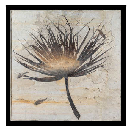
Fossil palm frond Green River Formation Paleogene, Eocene (53,5–48,5 mya) h. 1,10 m – l. 1,10 m Estimate: €55,000 - 65,000