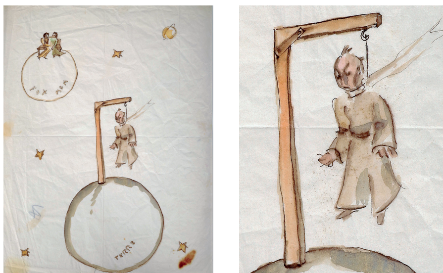
Antoine de SAINT-EXUPÉRY - Self-portrait as The Little Prince hanged, on the Earth planet; in the background, a couple entwined on a bench, on a planet called « Fox MGM » Ink and watercolor on paper | 27 x 21 cm | circa 1942/43 Estimate: €60,000-80,000

AUCTION ON THURSDAY 4 JUNE 2020 AT DROUOT