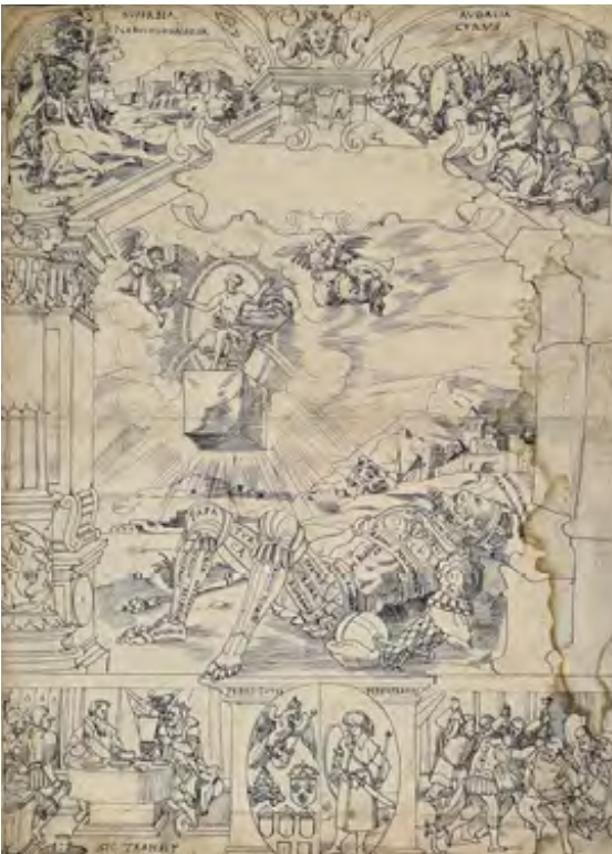
Hieronymus Vischer Le pouvoir temporel soumis au Christ 1589 Est. 8,000 - 12,000€