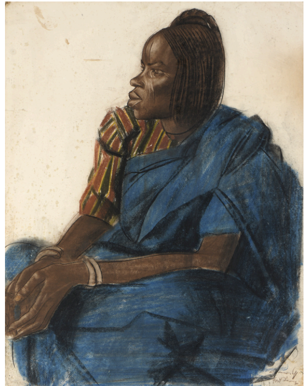
Alexandre Jacovlev Femme assise, Fort Lamy Est. 15,000 - 20,000€