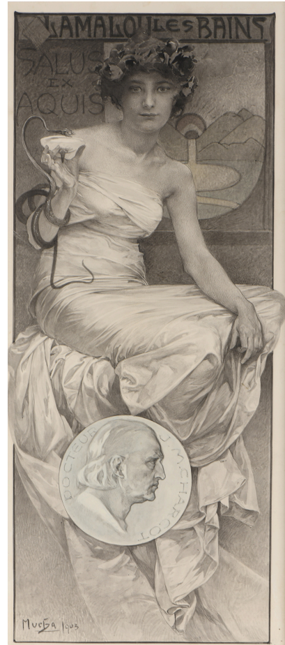
Lot 96 Alfons Mucha Lamalou les Bains Est. 8,000 - 12,000€