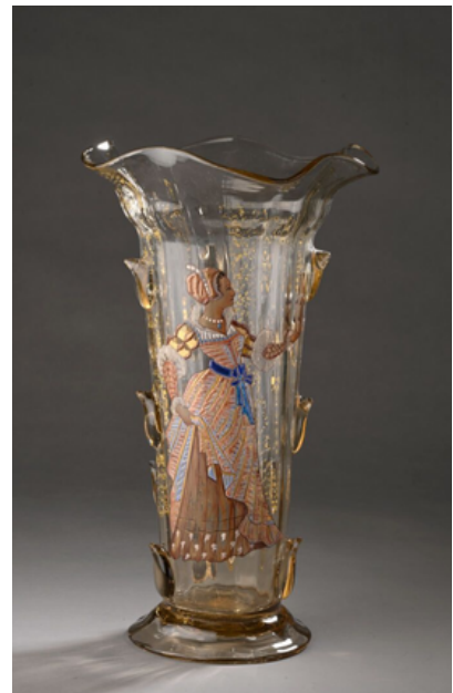
Lot 107 Emile Gallé Large cone-shaped vase adorned with a woman in a medieval outfit. Est. 2,000 - 3,000€