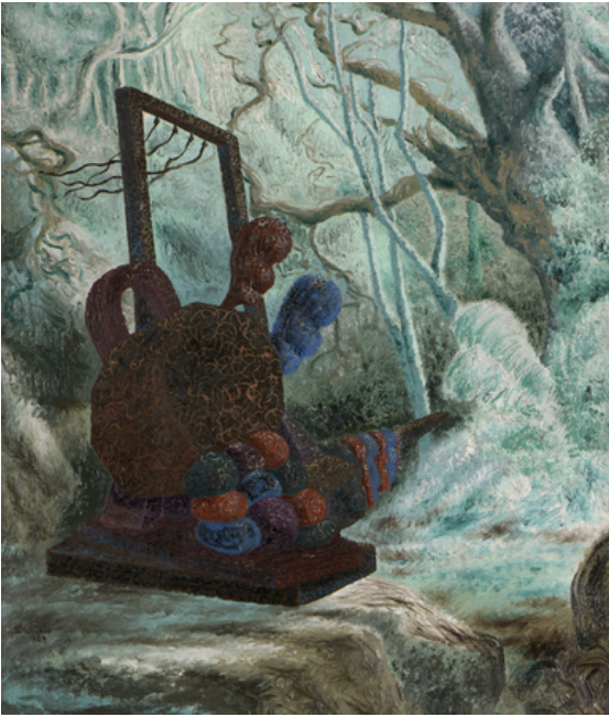
Alberto Savinio Machine pour féconder les arbres, 1929 Est. 150,000 - 200,000€