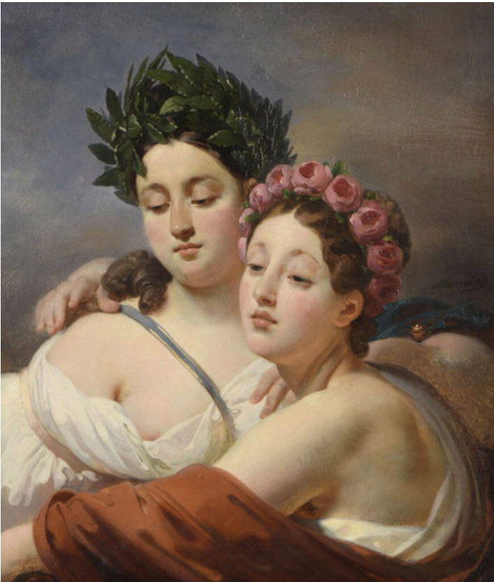
Lot 20 Jean-Baptiste Mauzaisse Etude pour un plafond du Louvre Est. 2,000 - 3,000€