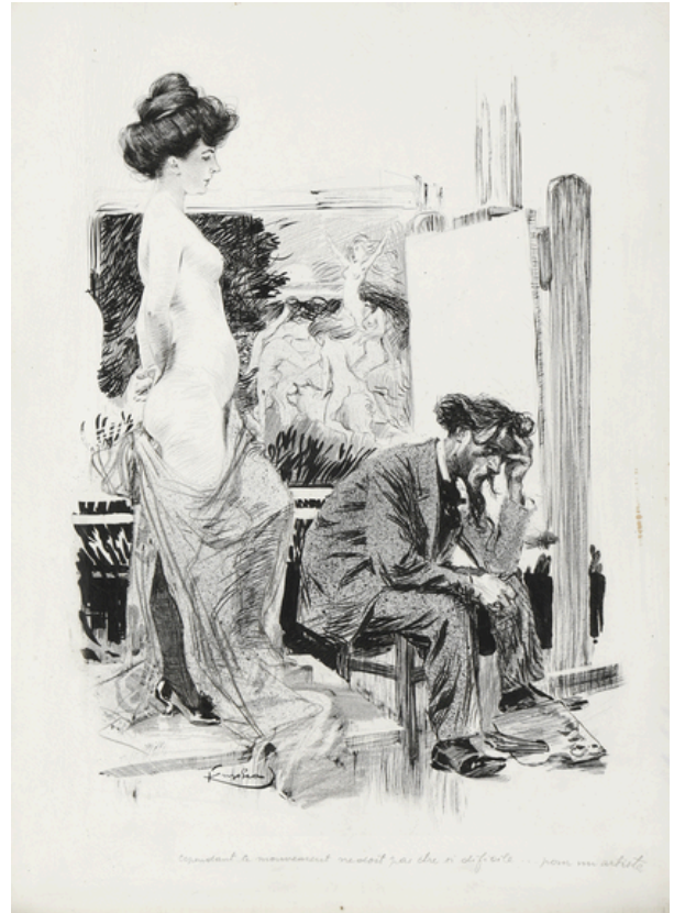
Frantisek Kupka Cependant le mouvement ne doit pas être difficile pour un artiste 1902 Est. 10,000 - 12,000 €