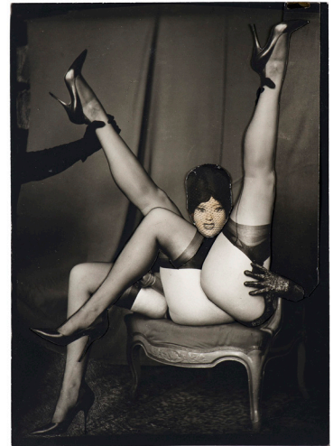
Pierre Molinier (1900-1976) Gog et Magog - 1968 Original collage

Finally the two celebrated dolls by Molinier with their famous plaster legs, some of his paintings from the 1930-50s or furniture in his studio including the easel, the full-length mirror, the stool, the screen in toile de jouy fabric and the printing frame and view camera, complete this historic sale.