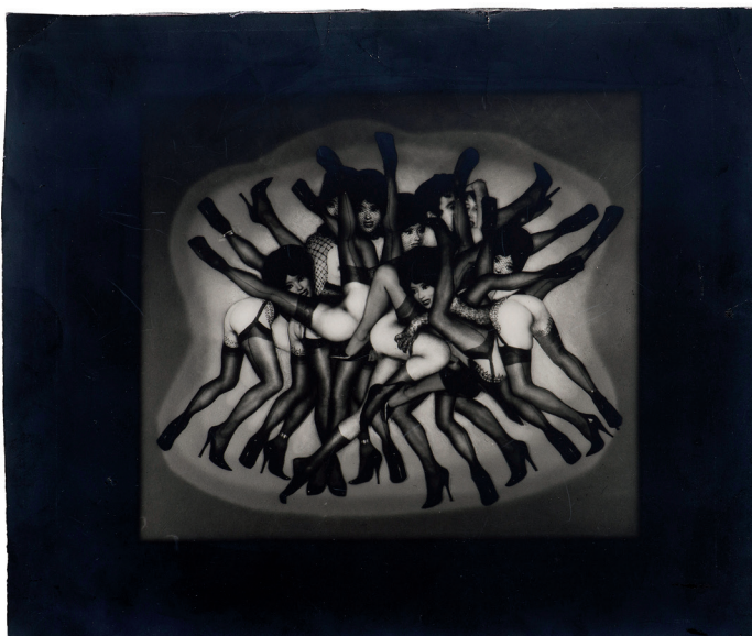
Pierre Molinier (1900-1976) Grande Mêlée - 1968 Photomontage Vintage silver print