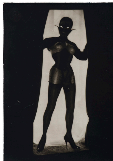
Pierre Molinier (1900-1976) Le Chaman - Circa 1967 Final photomontage Vintage silver print

DROUOT - Room 7 Monday, 14 November: 11 a.m. - 6 p.m.