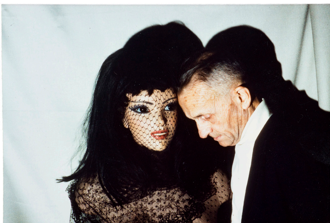
Pierre Molinier (1900-1976) Autoportrait avec la Poupée Circa 1968 Silver print