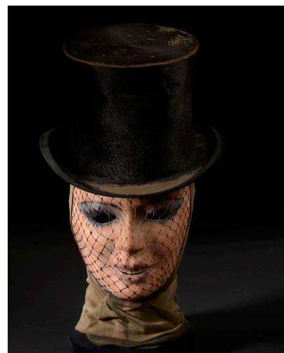
Pierre Molinier (1900-1976) Tête avec masque et haut de forme Sculpture Mixed technique