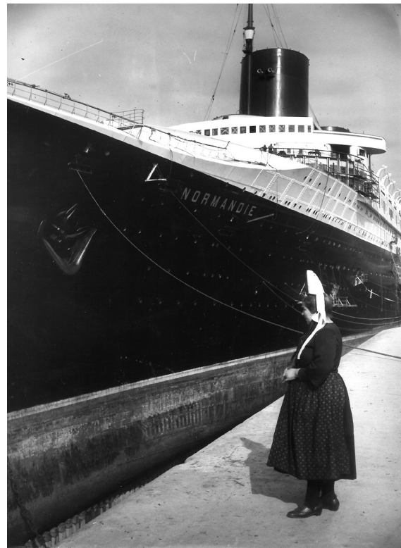
KEYSTONE, A Breton woman in front of the Normandie. Estimate (lot): €300-500