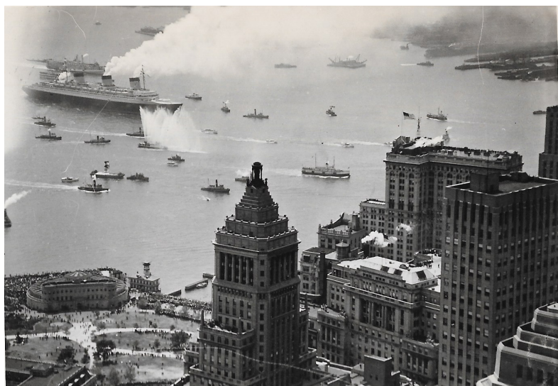
KEYSTONE, Triumphant arrival of the Normandie in New York Estimate (lot): €150-200 ©Tessier-Sarrou/Drouot