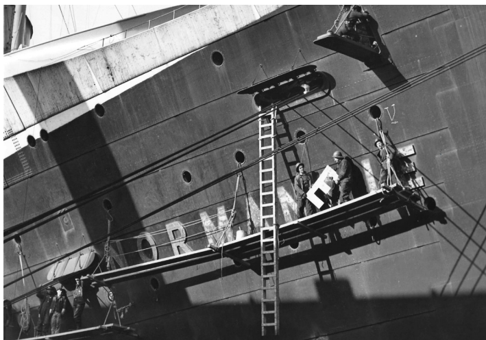
Changing the name of the Normandie Estimate (lot): €150-250

The declaration of war in 1939 leads to the Normandie being immobilised in New-York's harbour. As the United States is about to take part in the war in April 1941, the Congress votes the use of the liner for transporting troops. Important work is undertaken to equip the boat and to welcome 16,000 men aboard. All the furniture and décor is removed, except for the theatre, religious places and two luxurious apartments that are kept for commanding officers. The former 'Normandie' is renamed 'USS Lafayette'.