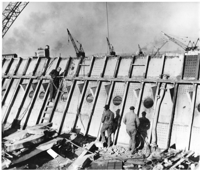
KEYSTONE, Demolition of the Normandie in Port Newark in 1947. Estimate (lot): €200-300 ©Tessier-Sarrou/Drouot

The 2,000 photographs comprised in the sale (grouped into 360 lots) retrace the life of the Normandie, from its birth to sad end. The original photographs and reprints from negatives by Roger SCHALL (1904-1995), François KOLLAR (1904-1979), DESBOUTIN and BYRON will take all collectors and connoisseurs through the fantastic destiny of this legendary boat.