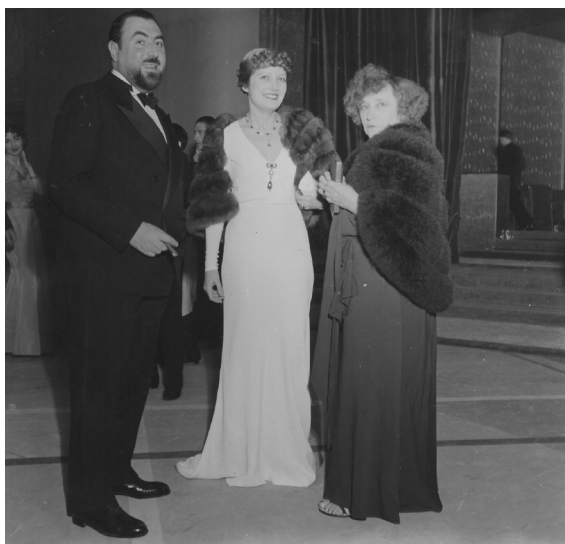
Roger SCHALL, Inaugural journey. Colette and the Director of the magazine Comœdia. Estimate (lot): €800-1000