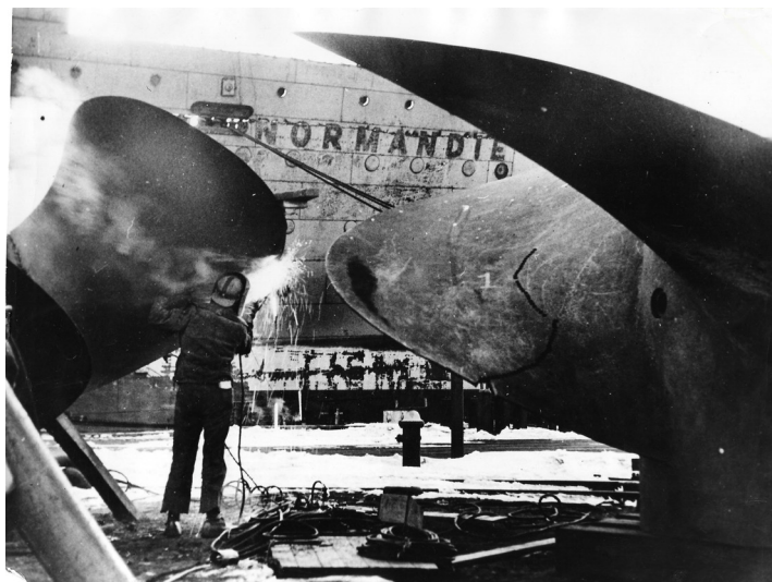
KEYSTONE, Demolition of the Normandie in Port Newark in 1947. Estimate (lot): €200-300 ©Tessier-Sarrou/Drouot