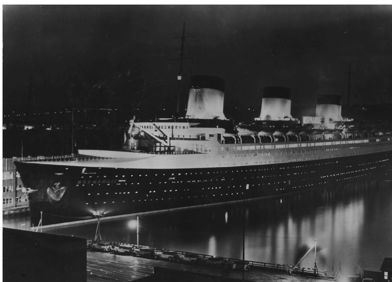
Gala dinner. 30 June 1935 in New-York. Estimate (lot): €200-300

The liner is finished four years later, and its extraordinary destiny can begin. On the eve of the departure in May 1935, an inaugural soirée is held aboard, welcoming no less than a thousand people, including French President Lebrun.