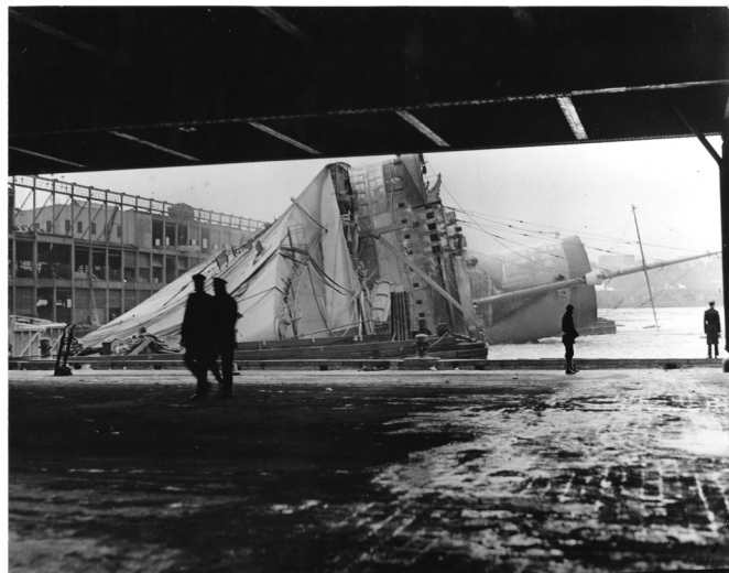
Press agency photograph. The Normandie on its side on the morning of 10 February 1942 after the fire. Estimate (lot): €150-250 ©Tessier-Sarrou/Drouot

On 9 February 1942 when additional work is still being done, a fire quickly spreads from the main living room to the deck. Over 10,000 tons of water are used to put the fire out, except the liner is thrown off balance and rolls on a side under the tide's pressure on the next night. Extremely damaged, the project of refurbishment is finally rejected. In 1945, the Navy wants to give the wreck back to France, which France refuses. It is then bought by the Lipsett brothers and demolished in 1947, generating a million-dollar profit.