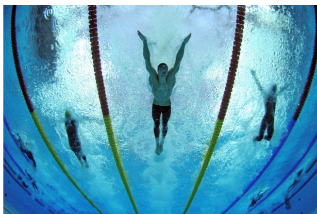
Lot 130 Beijing 2008. Michael Phelps, swimming 18 August 2008. 80 x 120 cm Estimate: €1,200 – 1,500