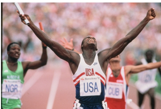
Lot 87 Barcelona 1992. Carl Lewis, 4x100m 8 August 1992. 53 x 80 cm Estimate: €800 – 1,200