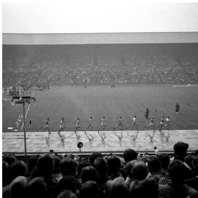
Lot 51 London 1948. 5000m 1st August 1948. 40 x 40 cm Estimate: €600 - 800