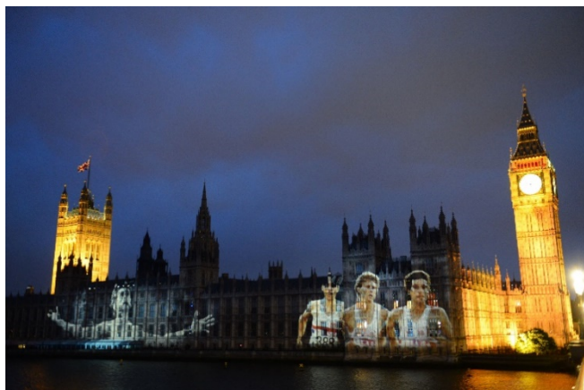
Lot 10 London 2012. Opening ceremony 27 July 2012. 53 x 80 cm Estimate: €800 – 1,200