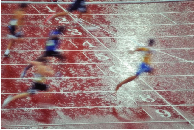
Lot 102 Beijing 2008. Decathlon 21 August 2008. 53 X 80 cm Estimate: €800 – 1,200