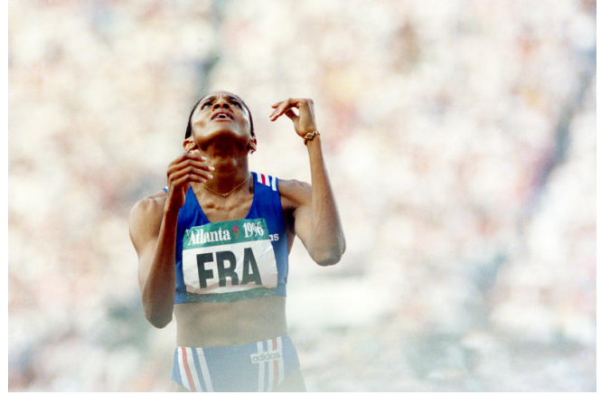
Lot 93 Atlanta 1996. Marie-José Pérec, 4x100m 3 August 1996. 53 X 80 cm Estimate: €800 – 1,200