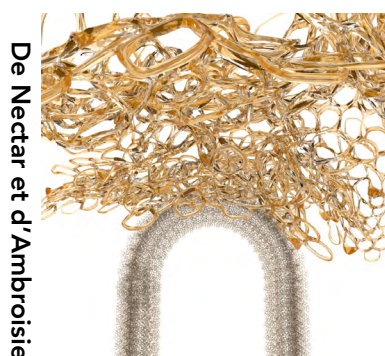
De Nectar et d'Ambroisie Interactive augmented reality experience