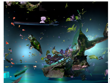
Florescendi 4K video

The artist plunges us into a speculative future, where samples of then-extinct plant species are preserved and exhibited in a virtual archive room. Through editing and visual strategies, this archive room sporadically transforms under the effect of the interference caused by the memory emanating from the listed plants, revealing the traces of a past that continues to haunt the place.